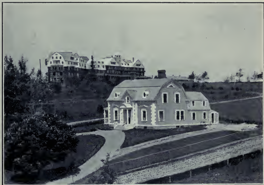
THE MANSE, ST. ANDREWS, N. B.