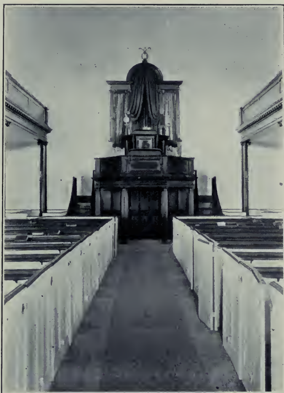
THE PULPIT. OF GREENOCK CHURCH. SHOWING DOVE OF PEACE.