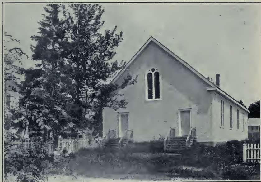
MEMORIAL HALL. CORNER STONE LAID JULY 14TH, 1893.